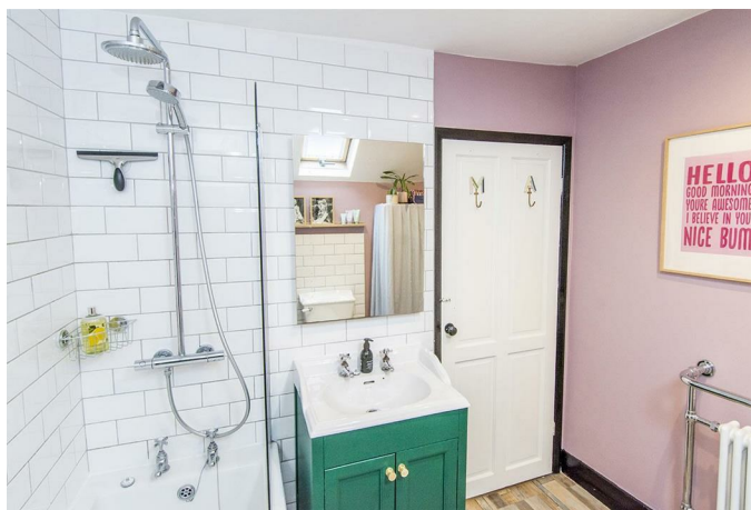
Bathroom Photo Two

Modern white suite comprising: Panelled bath with 'Rain' shower fitment over, vanity unit with inset wash hand basin, and low level WC. Combination heated towel rail and column radiator. Complementary tiling. Vinyl flooring. Wall mounted gas fired combination central heating boiler. Double glazed velux window.