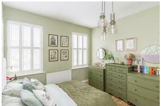
(Bedroom One, Photo Two)

A double bedroom with dual aspect double glazed windows, with fitted shutters, to the front elevation. Radiator and varnished floorboards.