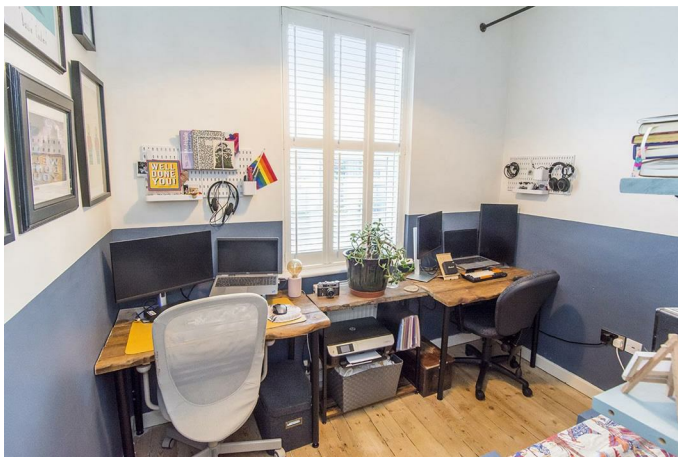
Bedroom Three 9'3" x 7'3" (2.82 x 2.21)

A single bedroom. Double glazed window, with fitted shutters, to the front elevation. Access to loft space. Radiator. This bedroom is currently set out as a work from home office.