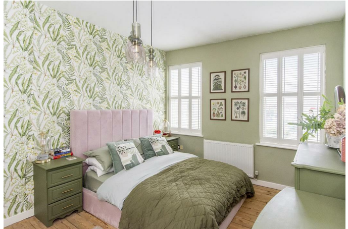
Bedroom One 14'8" x 10'11" (4.47 x 3.33)

A double bedroom with dual aspect double glazed windows, with fitted shutters, to the front elevation. Radiator and varnished floorboards.